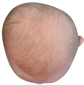
Before STARband® Treatment