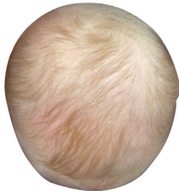
After STARband® Treatment

A cranial remolding orthosis is used to correct asymmetry in an infant's head usually caused by positional plagiocephaly. Infants are usually treated between the ages 3 to 18 months. In most cases when the asymmetry is treated early, it is correctable due to the malleability of an infant's head.